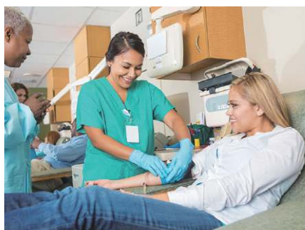
Hospital Collection blood center